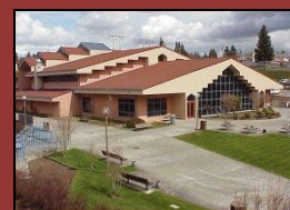
Renton Technical College