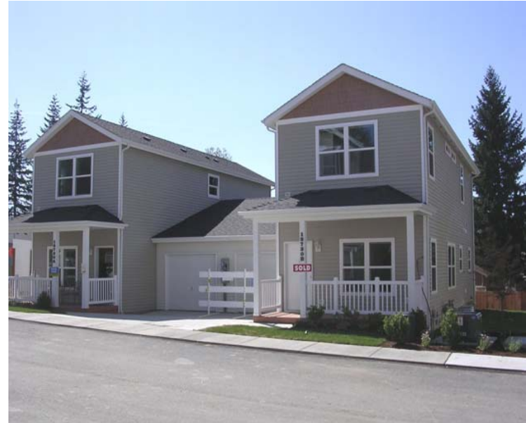
Kokanee Creek by Homesight Manufactured Housing HUD approved