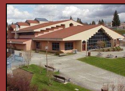
Renton Technical College